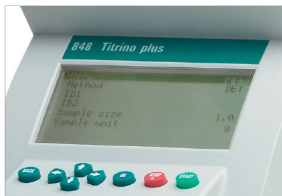
Everything at a glance – the large display of the 848 Titrino plus.