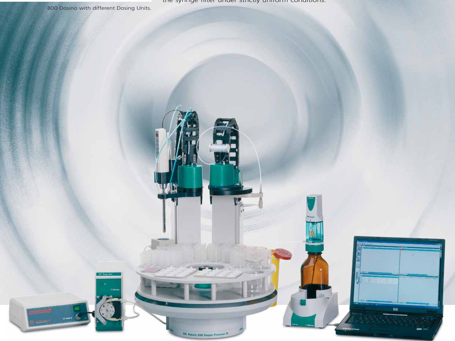
Robotic Filtration Soliprep – homogenization and filtration in one run.

Forget bulky dosing devices that clutter your lab bench – the Dosino is integrated in your Robotic Soliprep and mounted on the reagent bottle, which makes it an unrivaled space saver. Thanks to the proven Dosino technology it is possible to introduce sample solutions through the syringe filter under strictly uniform conditions.