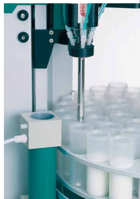
Pivoting arm for Polytron.

The height-adjustable pivoting arm allows optimal positioning of the Polytron. It also allows the exact addition of solvent immediately before the start of the homogenization