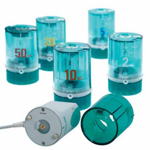
800 Dosino with different Dosing Units.

Forget bulky dosing devices that clutter your lab bench – the Dosino is integrated in your Robotic Soliprep and mounted on the reagent bottle, which makes it an unrivaled space saver. Thanks to the proven Dosino technology it is possible to introduce sample solutions through the syringe filter under strictly uniform conditions.