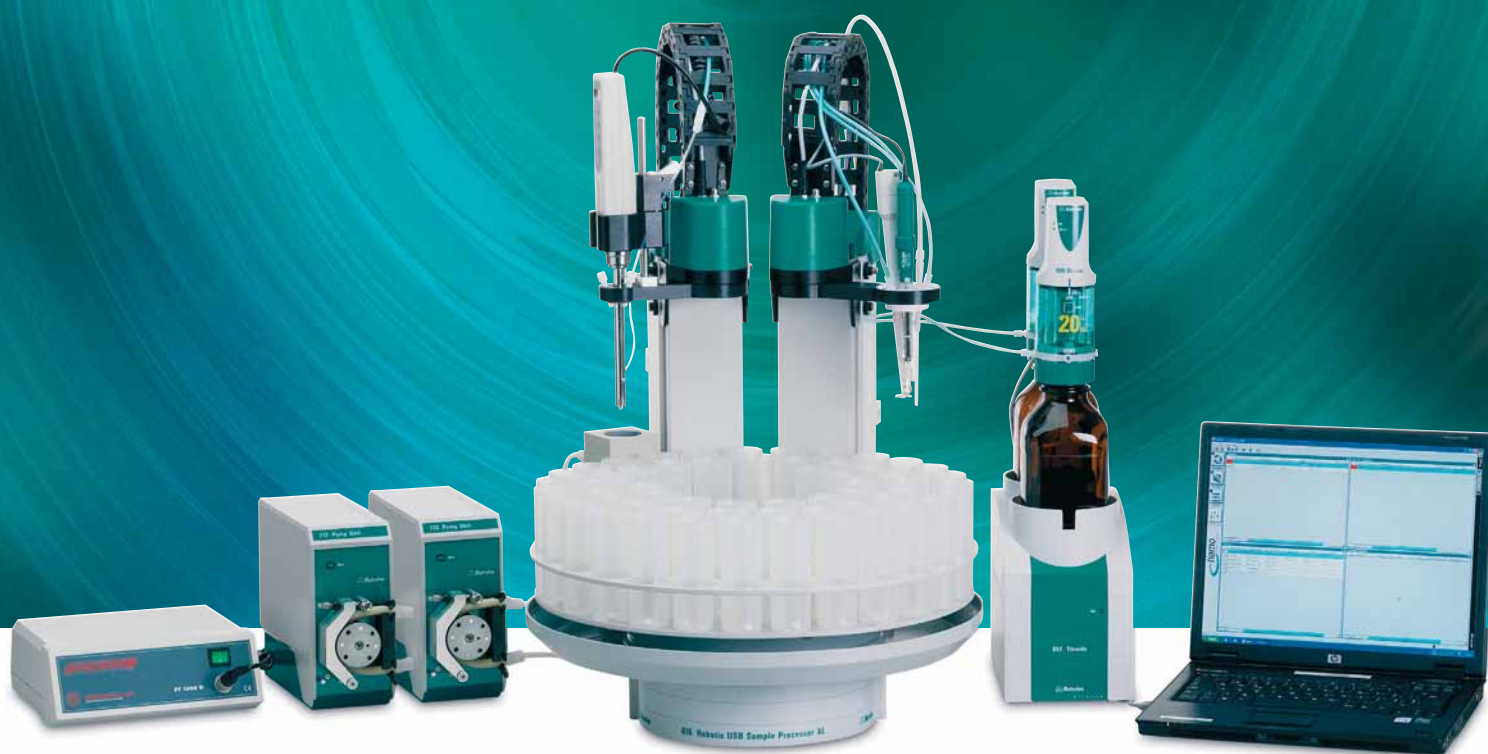
Robotic Titration Soliprep – homogenization and titration in one run.

Together with the rinsing station, the tried-and-tested 772 Pump Unit constitutes the optimal cleaning unit. It's up to you to decide whether the dispersing aggregate is to be cleaned by immersion in a cleaning solution or by spray nozzles. The powerful peristaltic pump leaves nothing to be desired.