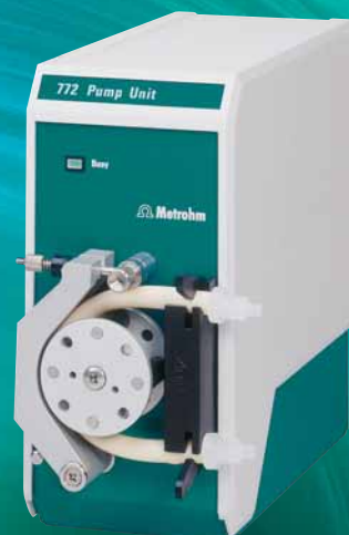
772 Pump Unit

Together with the rinsing station, the tried-and-tested 772 Pump Unit constitutes the optimal cleaning unit. It's up to you to decide whether the dispersing aggregate is to be cleaned by immersion in a cleaning solution or by spray nozzles. The powerful peristaltic pump leaves nothing to be desired.