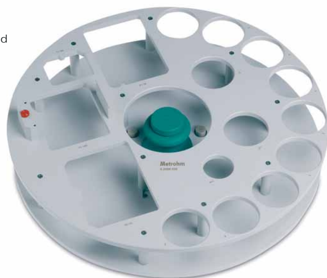
Sample rack with code.

Encoding enables each insert to be taken out for filling and reinserted correctly so that mix-ups are ruled out.